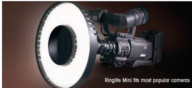
Ringlite Mini fits most popular cameras

The Ringlite Mini employs powerful LEDs laid out in a tightly plotted grid. Lighting is divided into three separate user-selectable segments (bottom, middle, top). A separate, master dimmer circuit controls channels of output. On the back, four toggle switches regulate power and control upper, center and lower illumination. An ergonomic integrated control knob allows for instant dimming from 100%-0 with minimal shift in color, plus there is remote dimming capability. Completely flicker and heat free, the system can be moved in comfortably close to a subject, for soft, wrap-around light. A set of 6 interchangeable conversion and diffusion filters is available.